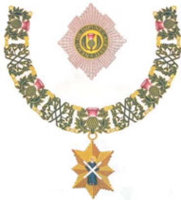
The insignia of a Knight of the Thistle.

W ha daurs meddle wi me, roughly translated, is the motto of The Most Ancient and Most Noble Order of the Thistle. Actually, on the Order's badge it says in Latin " Nemo me impune lacessit " (No one provokes me with impunity). Most Ancient and Most Noble notwithstanding, I think we would all agree that the rough Scots version has the most ominous tone.