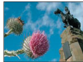
A thistle in Princes Street Gardens, Edinburgh, frames the statue honouring the Royal Scots Greys.