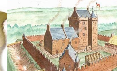
Dalkeith Castle (12th C.) was originally in the hands of the Grahams but was ceded to the Douglas family in the early 14th Century. The castle was strategically located above a bend in the River North Esk.