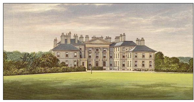
Construction of the present Dalkeith Palace, modelled on Dalkeith is in fact the adminis-William of Orange's Palace of Het Loo in the Netherlands, trative centre for the Midlothian began in 1702 and was completed around 1711. This painting council area, with a population shows the palace as it was in 1880.

it would have been called a county town. Even so, that sounds pretty humdrum to have such a nice strathspey named after it.