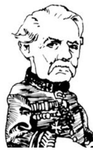
I.M. Moncreiffe of that Ilk (from Lord Oj The Dance)