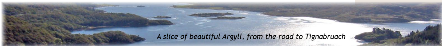
A slice of beautiful Argyll, from the road to Tignabruch