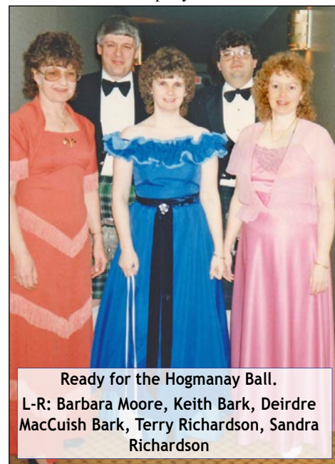
Ready for the Hogmanay Ball.

Following the Skyline, the Ball moved around a little because, like so many SCD events, we did not purchase enough hotel drinks! We returned to the Delta Meadowvale Inn, as it was by then called, for a couple of years before going to the Holiday Inn at Trafalgar Rd, Oakville (now closed). Over time the after-midnight meal moved to being a mid-evening meal, then snacks and the afters party shortened in time-frame – we were getting older.