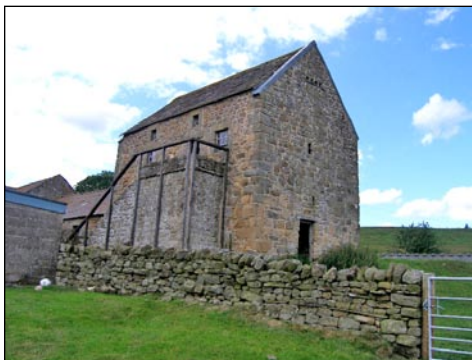
A typical Borders Bastle House

- usually cattle - and had a separate entrance. The doorway was constructed so that protective bars could be slid into place, the windows were high up, and so the house was well protected from an attack from "Border Reivers".