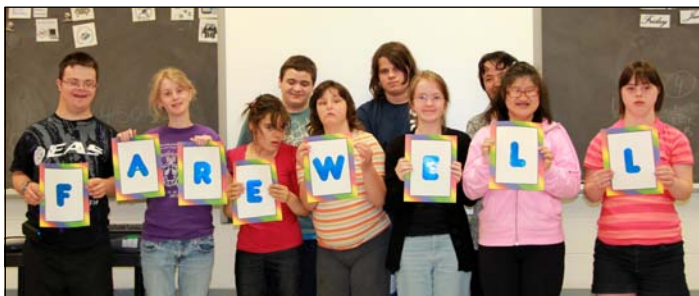
Editor: The Newsletter Committee appreciates the assistance of the students in helping to prepare Set & Link for delivery for many years.

The Staff and Students of N.H.S. Community Class