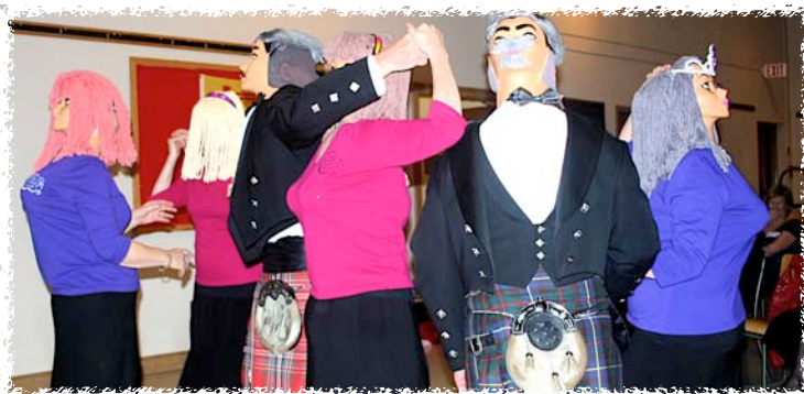
Are they dancing into 2012 or looking back to 2011?

For a schedule of new sessions, visit shiftnbobbins.webs.com . For additional information email strathspey@me.com .