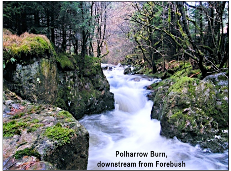
Polharrow Burn, downstream from Forebush