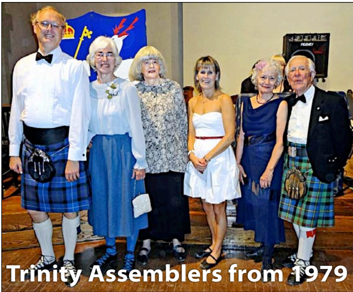
Trinity Assemblers from 1979