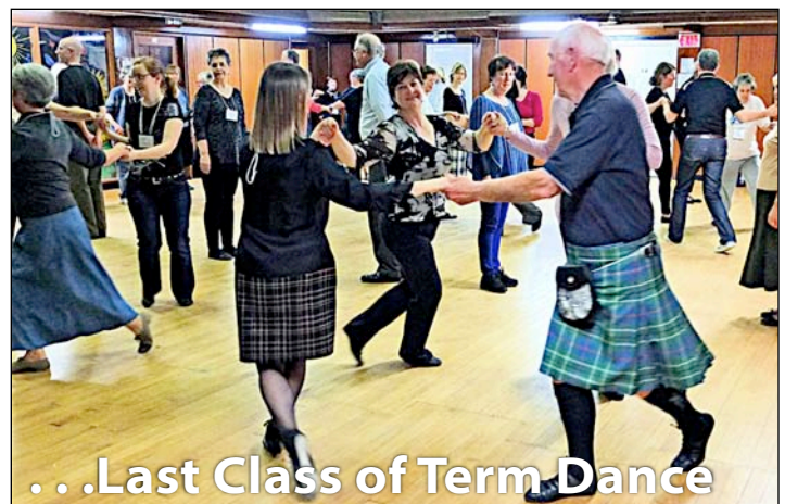
...Last Class of Term Dance