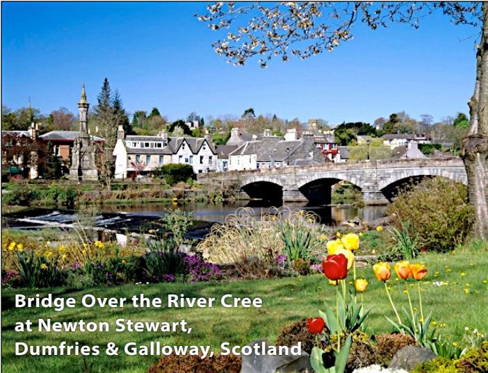
Bridge Over the River Cree at Newton Stewart, Dumfries & Galloway, Scotland

Robbie Burns' Day has come and gone; the 2014 Tartan Ball is a warm glow in the mists of time, and spring might well be just around the corner. So what's next? Well, let's consider the March Monthly Dance in which we can give recognition to all those newcomers in our Beginner classes, and have them feel right at home as members of RSCDS Toronto.