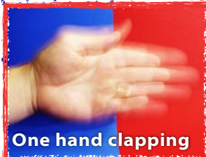
One hand clapping