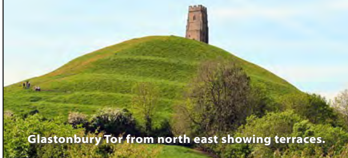
Glastonbury Tor from north east showing terraces.

Steeped in mystery and mythology, Glastonbury is well worth a visit, should one be spending any vacation time within reach of the English county of Somerset (if you lived there you'd call it Zummerzet!). One would find it interesting to go there, not just to see its Tor, but to savour the Arthurian mystique of that area — which was certainly my experience when I visited there about 20 years ago. Of course, I refer to the legendary King Arthur. Remember his sword Excalibur, the Knights of the Round Table, and the search for the Holy Grail? Easy to reach, Glastonbury is just a few clicks south of the Roman city of Bath. The M5 motorway is also close by, giving you a quick southerly connection to Devon and Cornwall, or north to Birmingham.