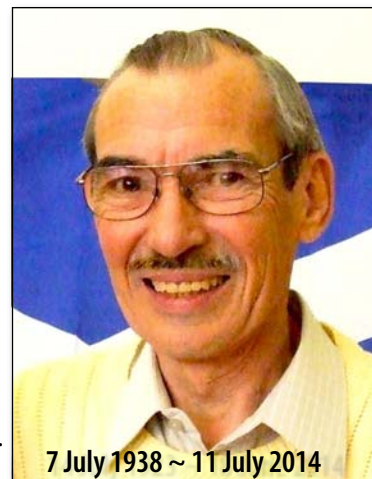
7 July 1938 ~ 11 July 2014