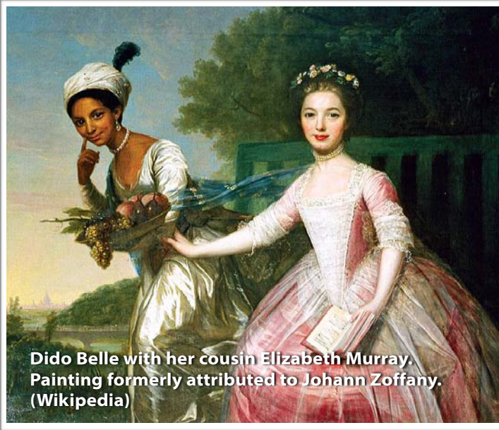
Dido Belle with her cousin Elizabeth Murray. Painting formerly attributed to Johann Zoffany.

was back in 1980, when the Earl had been appointed Minister of State to the UK Parliament's Scottish Office. But why get into this now?