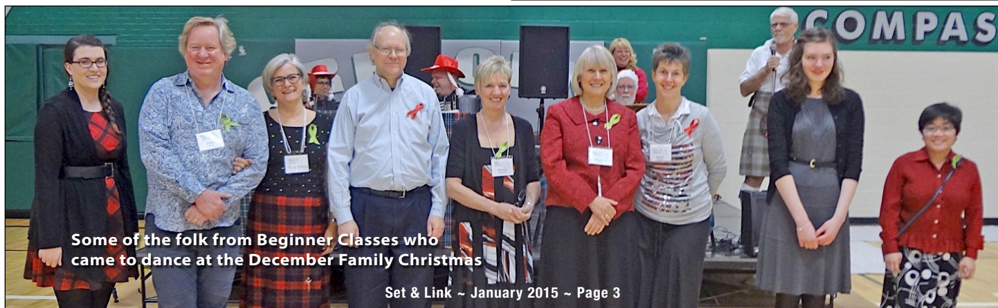
Some of the folk from Beginner Classes who came to dance at the December Family Christmas