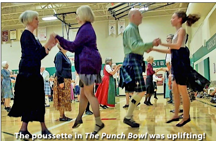
The poussette in The Punch Bowl was uplifting!