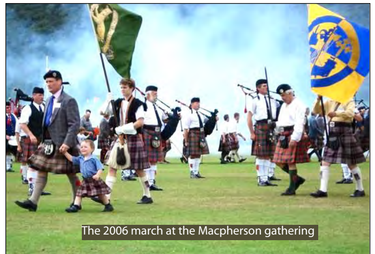
The 2006 march at the Macpherson gathering

"From and after the first day of August, one thousand seven hundred and forty seven, no Man or Boy, within that part of Great Britain called Scotland, other than such as shall be employed as Officers and Soldiers in His Majesty's Forces, shall, on any pretence whatsoever wear or put on the Clothes commonly called Highland Clothes (that is to say) the Plaid, Philabeg, or little Kilt, Trowse, Shoulder Belts, or any part whatsoever of what peculiarly belongs to the Highland Garb; and that no Tartan, or party-coloured Plaid or Stuff shall be used for Great Coats, or for Upper Coats; and if any such Person shall presume after the first day of August, to wear or put on the aforesaid Garments, or any part of them, every such Person so offending, being convicted thereof by the Oath of One or more credible Witness or Witnesses before any Court of Justiciary or any one or more Justices of the Peace for the Shire or Stewartry, or Judge Ordinary of the Place where such Offence shall be committed, shall suffer imprisonment, without Bail, during the space of Six Months, and no longer, and that being convicted for a second Offence before a Court of Justiciary, or at the Circuits, shall be liable to be transported to any of His Majesty's Plantations beyond the Seas, there to remain for the space of Seven Years."