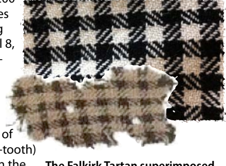
The Falkirk Tartan superimposed on a modern reconstruction

When a tartan is registered, its name cannot exceed 200 characters, and the name must be unique from all names already registered in the Register of Tartans. The naming and registration of tartans began 201 years ago on April 8, 1815. The earliest documented tartan in Britain was discovered in Falkirk, Stirlingshire, Scotland. It was found seven feet underground in the mouth of a red earthenware pot-bellied jar that contained at least 1925 silver Roman coins. The newest coin in the collection is dated 230 AD. Although small, the cloth stuffed in the mouth of this jar is clearly the type known as weft-woven (or dog-tooth) check in woollen fabric. Northern Europe was famous in the Roman world for this check-patterned cloth (Latin sucutulata), and this fragment exemplifies this technique.